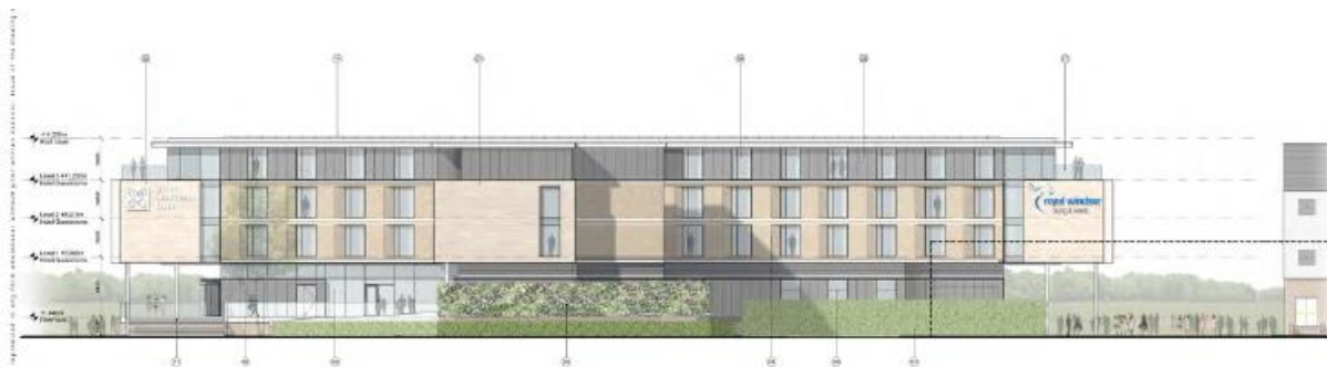
SOUTH ELEVATION (1:125@A1 / 1:250@A3)