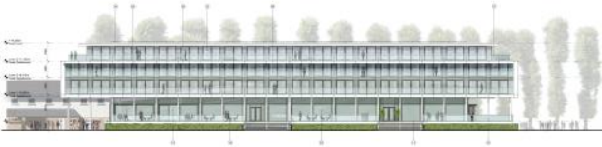
NORTH ELEVATION (1:125@A1 / 1:250@A3)