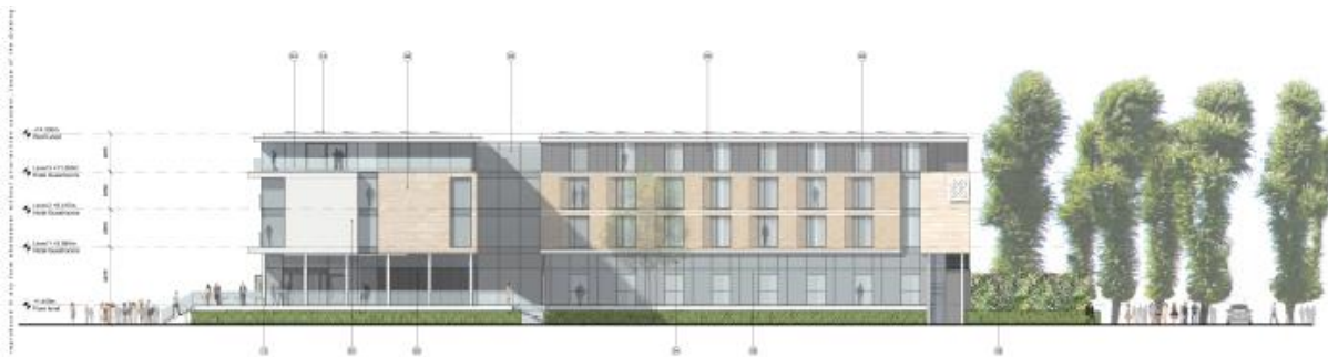
WEST ELEVATION (1:125@A1 / 1:250@A3)